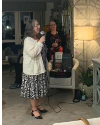
Halloween Party revellers having a great time