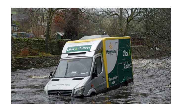
Its about time they get the sat nav right for Chantry Gardens!