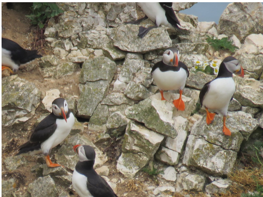
Puffins

Website: www.rspb.org.uk/days-out/reserves/bempton-cliffs