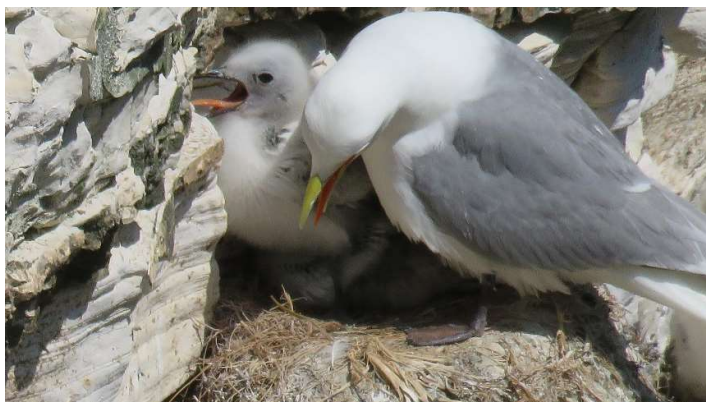
Motherhood is a real cliffhanger for this Gannet (left) and Kittiwake (right) and their chicks..