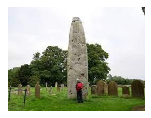
Rudston Monolith Above

The Triton Inn, Sledmere, does delicious food, their 'Pork Diane' excellent....coffee, not so good,